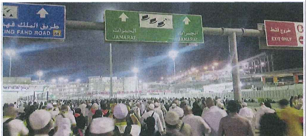
Pilgrims walking towards the Jamrat complex in Mecca yesterday.

He urged Malaysian pilgrims to keep their discipline and stick to the schedule fixed by Saudi Arabia and TH to deter untoward incidents.