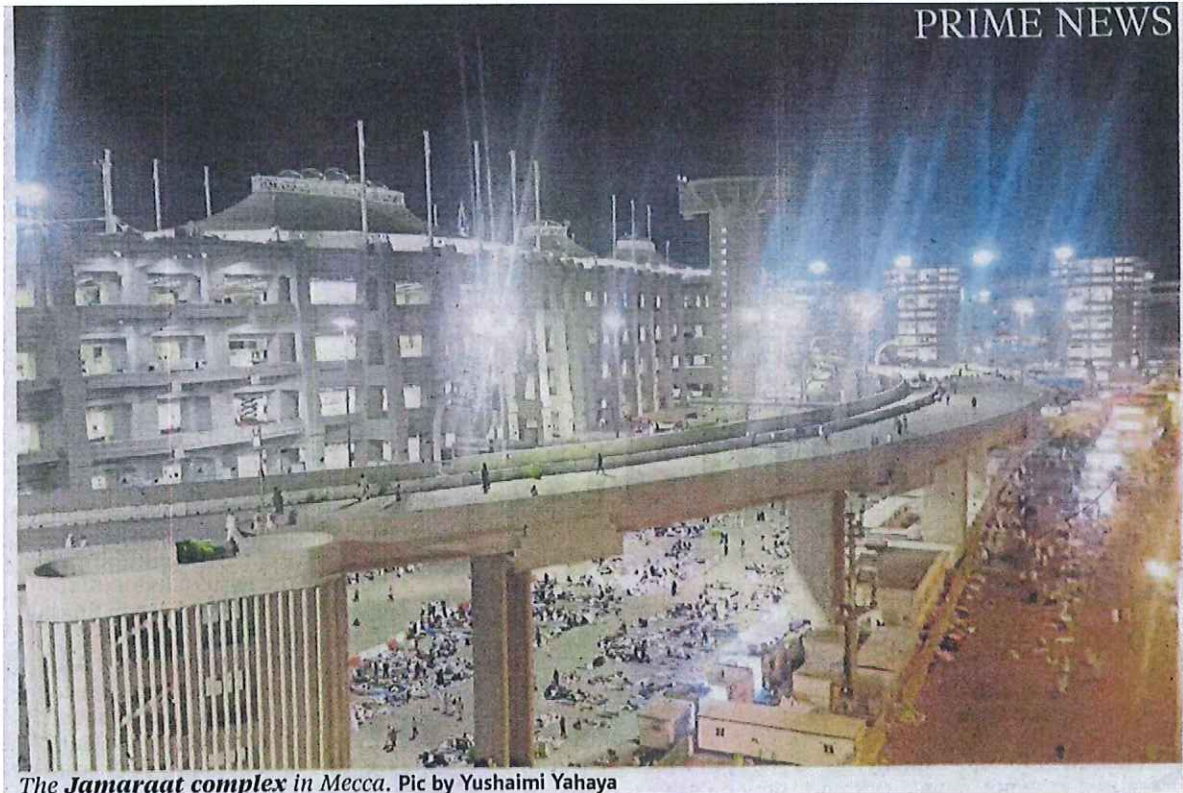
The Jamaraat complex in Mecca.