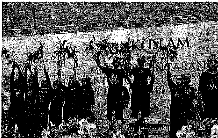
Showing support for 'Our Planet, We Decide' programme (SK Seri Aman, Pasir Puteh, Kelantan).

"We believe that the act of helping the children and youths in achieving their dreams will help the Bank as well. Tomorrow's Bank Islam bankers could be today's schoolchildren."