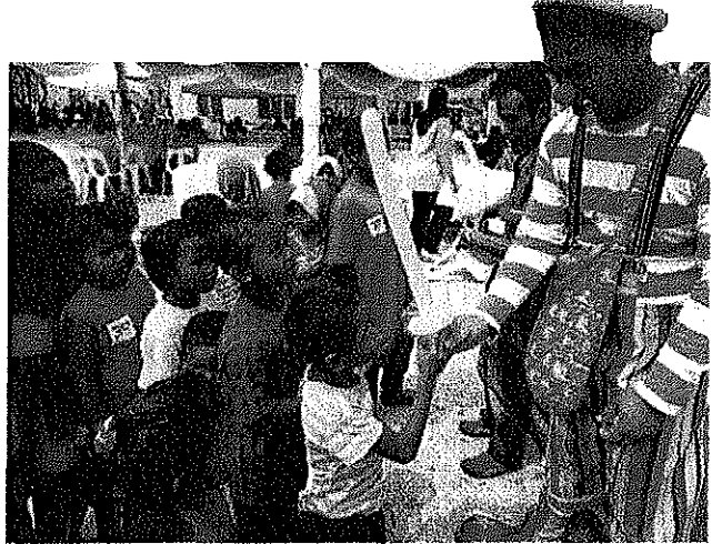
Entertaining the Children of the Orang Asli Community at Kg Leryar, Ringlet, Cameron Highlands.