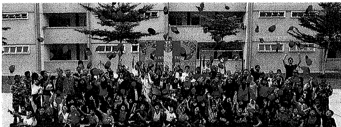
Graduating from Kem Jati Diri (25 Batalion Rejimen Askar Melayu DiRaja, Kem Bentong, Bentong, Pahang).