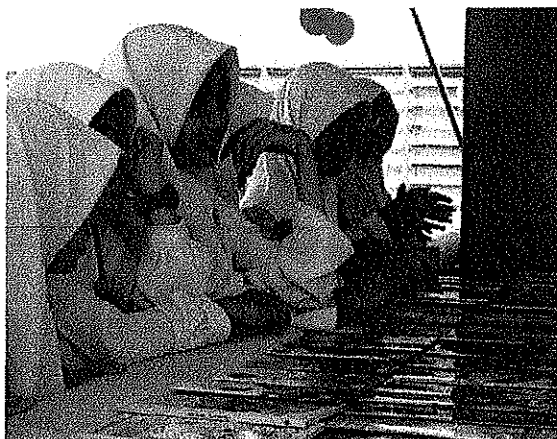
Love to read, key to English proficiency — English Communication workshop at SK Kuala Kupang, Kedah.