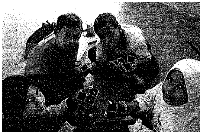
Showing the fruits of their labour — Food Garden Creative workshop at SK Kuala Kupang, Kedah.