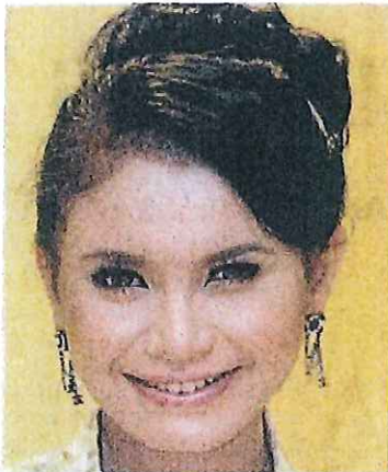
Indonesian songstress Rossa, or Sri Rossa Roslaini Handiyani , receives DIMP