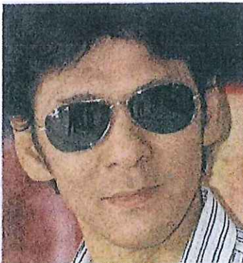
Singer Jamal Abdillah is among 90 receiving DIMP, which carries the title Datuk