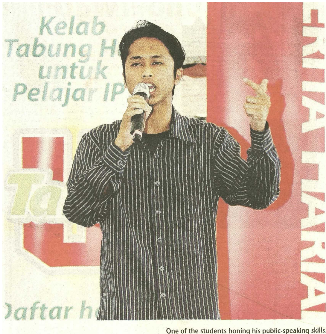
One of the students honing his public-speaking skills.

Language English Page No s6,7 Article Size 1489 cm 2 Color Full Color ADValue 44,045 PRValue 132,135