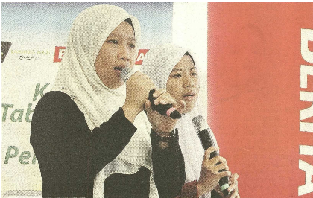
Students taking part in the karaoke session.