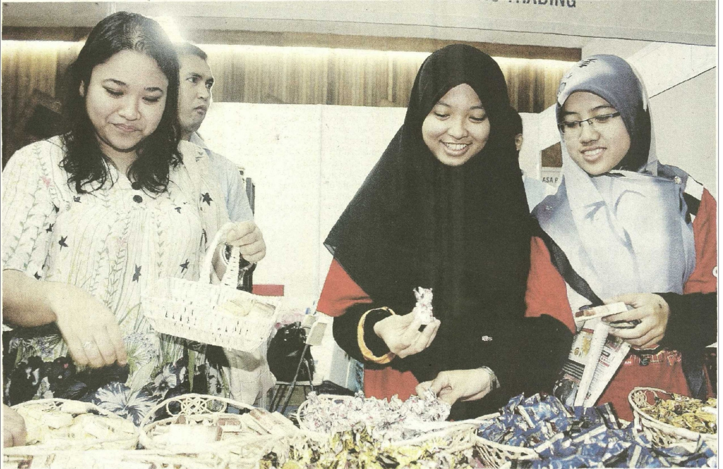
The Chocolate Fair drew visitors in droves.

Language English Page No s6,7 Article Size 1489 cm 2 Color Full Color ADValue 44,045 PRValue 132,135